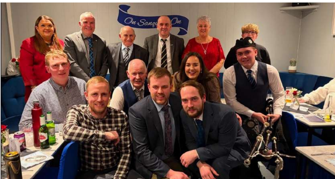
Left: A superb 'top table' for The Crown's annual Burns Supper

The evening came to a close in the traditional manner joining in singing Auld Lang Syne. Another superb evening was had by all, and they are already looking forward to next years' supper.